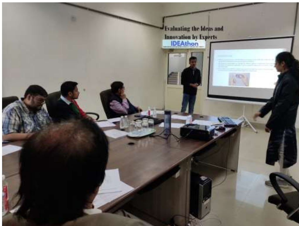
Student pitching their idea before jury