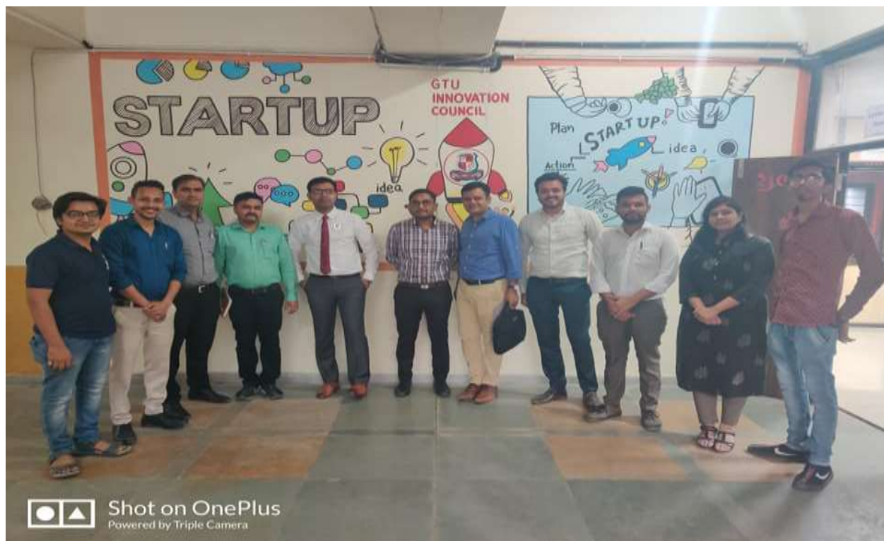
Invited Jury & experts with AIC & GISC Team