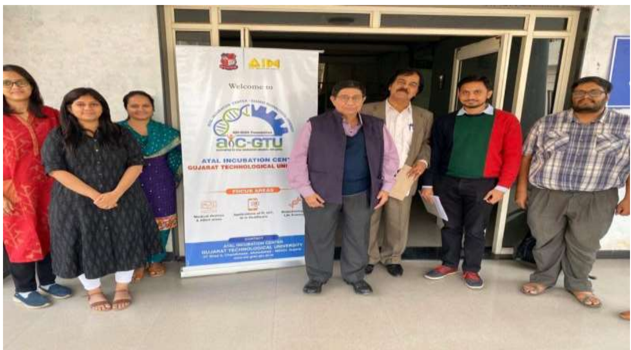
AIC team with invited jury