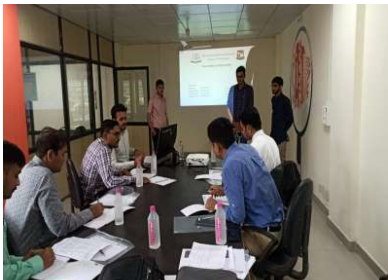
Applicants pitching ideas before the Invited Jury & Interaction with the experts on their project ideas